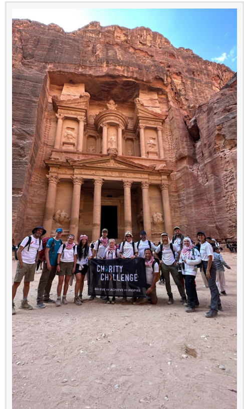
The trekkers at their destination