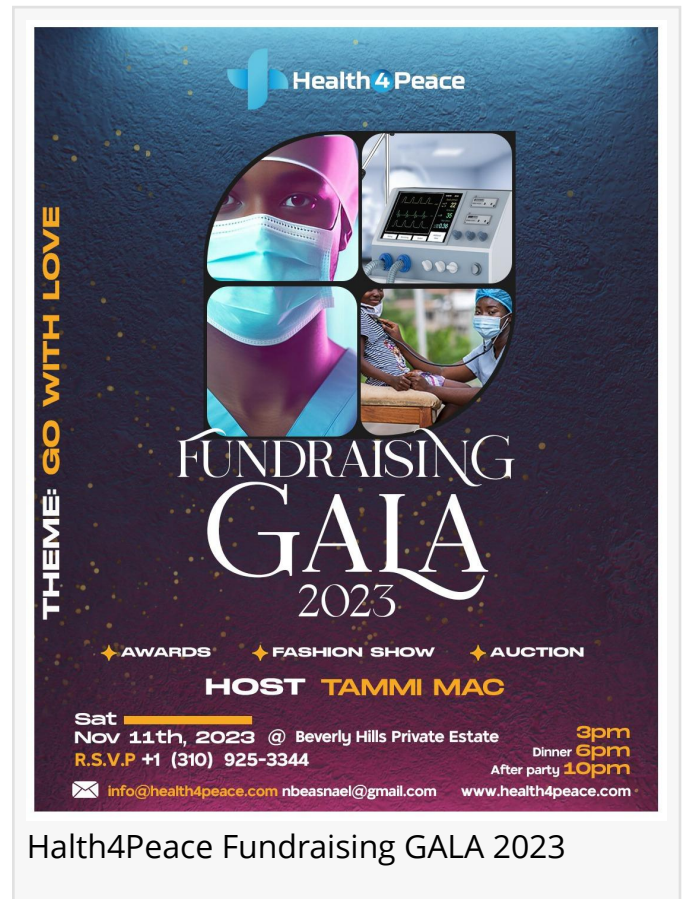
Health4Peace Fundraising GALA 2023