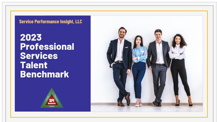
Report Cover - 2023 PS Talent Benchmark Report