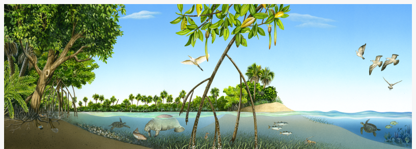
SEAGRASSES ARE FOUND IN BACKREEFS