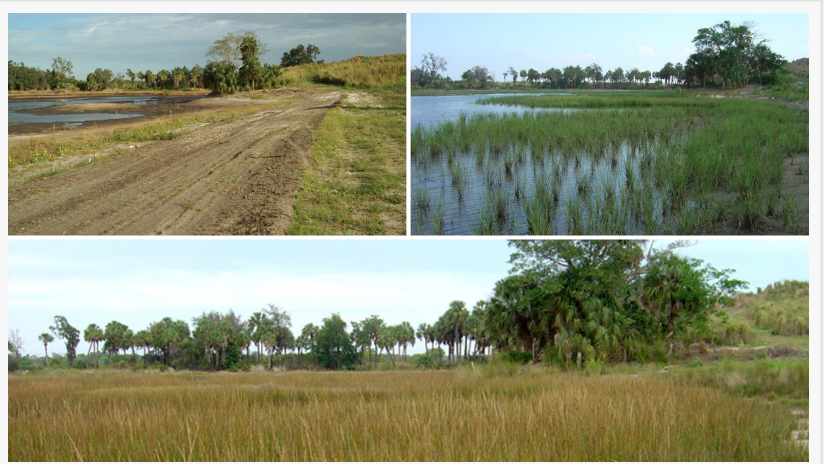
SUCCESSFUL SEAGRASS RESTORATION IN FLORIDA

This press release can be viewed online at: https://www.einpresswire.com/article/665490925