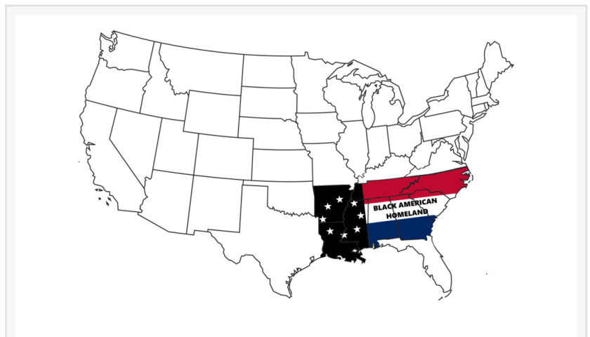
Black American Homeland Flag Map

Given that Black Americans are not a monolith, the party would be divided into various factions, including Black Nationalists, Black Conservatives, Black Centrists/Moderates, Black Progressives, and Black Liberals. The Black American Homeland Political Party's agendas and policies would be positioned slightly right of center/moderate. The goal is to address the concerns of all factions and reach a consensus that benefits everyone involved.