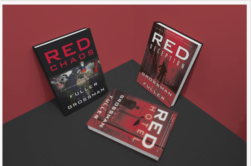
Red Hotel Series - 3 Books

RED HOTEL: Terrorists bomb a hotel in Tokyo, but the reverberations are felt around the world. A high-ranking Kremlin diplomat is assassinated. A building in Kiev blows up. Russia begins to amass forces along its western borders. Former Army intelligence officer Dan Reilly, now an international hotel executive with high-level access to the CIA, believes the plot is much bigger than anyone imagines, involving the empire-building, Putin-esque president of Russia.