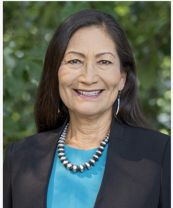
Deb Haaland, United States Secretary of the Interior under President Biden