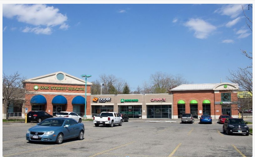
Discover the Heartbeat of Glenville: Glenville Towne Center, Your Hub for Business and Community

CLEVELAND , OH, USA , October 3, 2023 /EINPresswire.com/ -- Glenville Towne Center , a vibrant commercial property nestled in the heart of Cleveland. The property's owners, CRE-PRO LLC and Infinite Equity Capital LLC, are pleased to announce the center's newest tenant, Eleanor's Café, located at 10509 St Clair Ave., Cleveland, OH 44108.