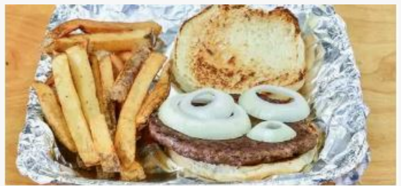
Sink Your Teeth into the Irresistible Goodness of Eleanor's Café Signature Burger