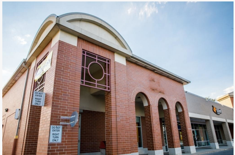
Experience the Flavorful Delights of Eleanor's Café at Glenville Towne Center