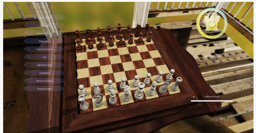
Fritz - Don't call me ChessBot (screenshot 3D board)