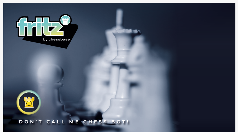
Fritz - Don't call me ChessBot

Playful Commentary: Fritz accompanies the user with witty and