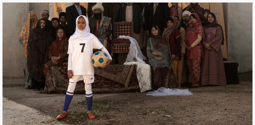
Right To Play reaches millions of children each year in 15 countries around the world

OSLO, NORWAY, September 25, 2023 /EINPresswire.com/ -- The Norwegian Sports-Tech company and developers of Active Gaming, Playfinity , today announced their partnership with the Canadian Branch of Right To Play (RTP) , a dedicated global non-profit organization on a mission to protect, educate, and empower kids. This partnership represents a significant stride in their journey to create a positive impact on a broader scale and aims to harness the profound influence of play in the lives of children facing marginalized circumstances.