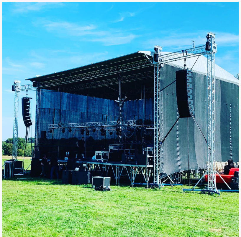
12m X 10m outdoor festival stage