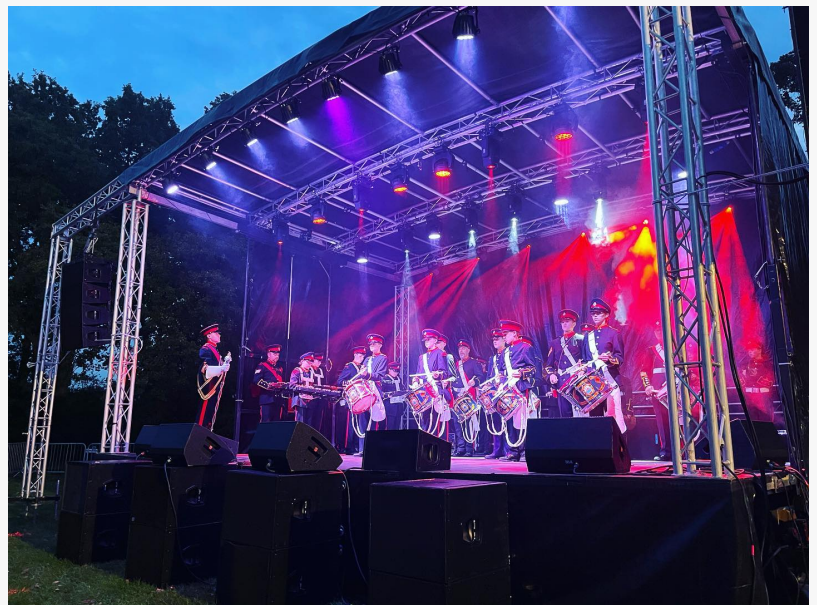
Outdoor mobile stage