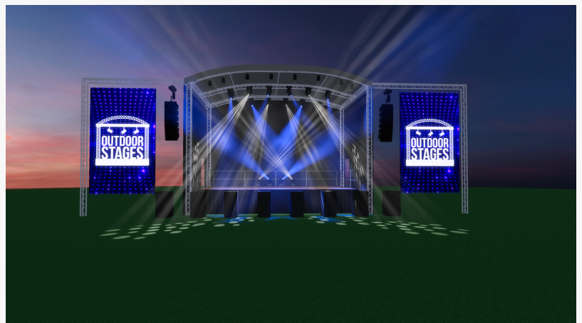
7m X 5m outdoor festival stage

With that added prestige, the pressure was on for Outdoor Stages to deliver a stunning stage production, including state-of-the-art sound, lighting, and visuals - What an amazing success, we had a lot of fun & look to returning next year with a bigger stage, more lighting & lots more outdoor LED screen !