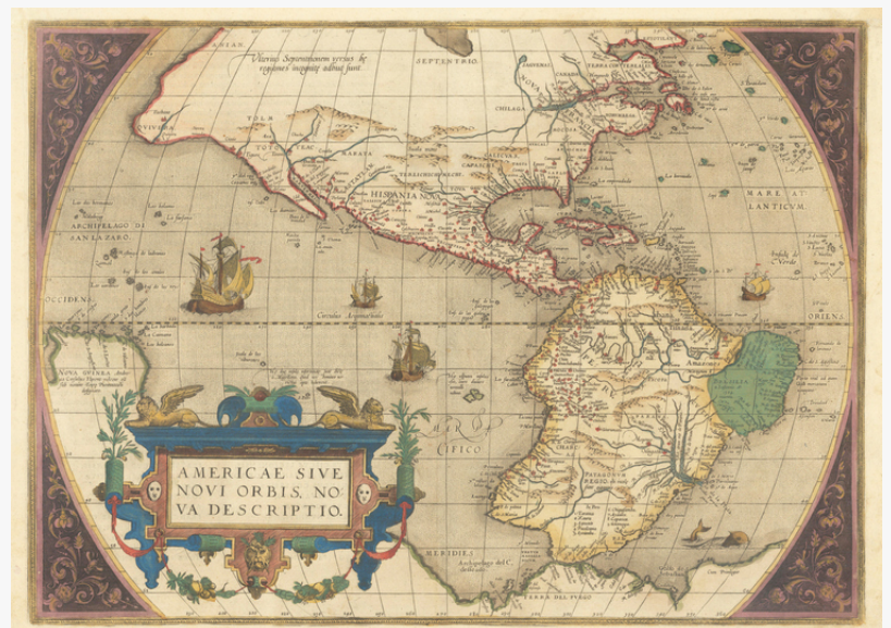
Americae sive Novi Orbis, Nova Descriptio, by Abraham Ortelius (1579), a famous map of America that had influenced New World cartography. Estimate: $5,500-$6,500.