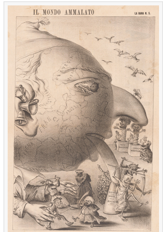
Il Mondo Ammalato is an 1879 broadside that illuminates the Ottoman Empire's struggles after the Russo-Turkish War. This satirical piece is expected to realize $750-$1,000.

People can register to bid online at https://www.oldworldauctions.com/register . Bidders may also call in their bids, at 804-290-8090, or email them, at info@oldworldauctions.com . Previews will be held by appointment only during regular business hours, Monday thru Friday, from 8:30