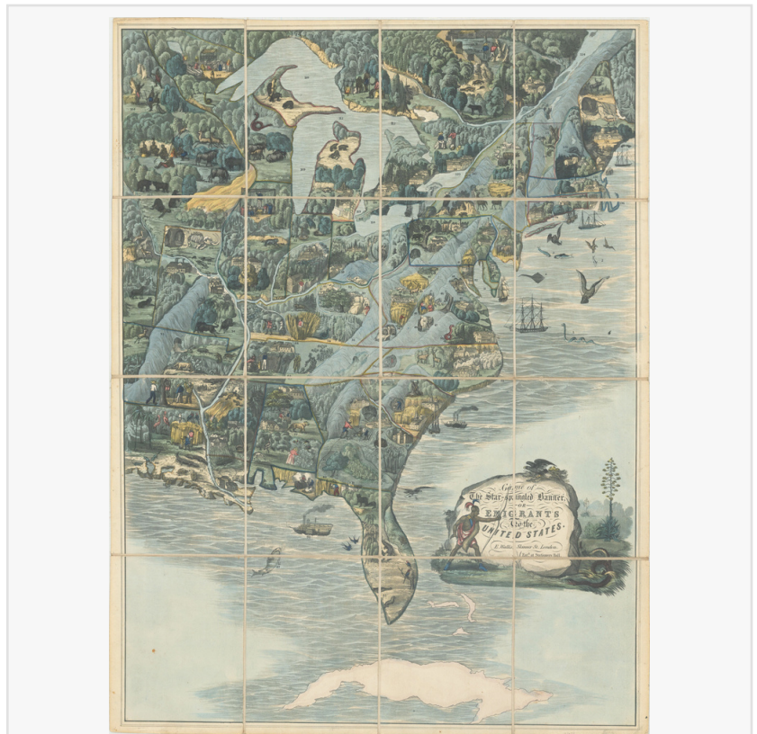
Game of the Star-Spangled Banner, or Emigrants to the United States by Edward Wallis (1840), one of the earliest game maps of the United States. Estimate: $5,500 - $7,000.

Eliane Dotson Nye & Company Auctioneers +1 804-290-8090 email us here