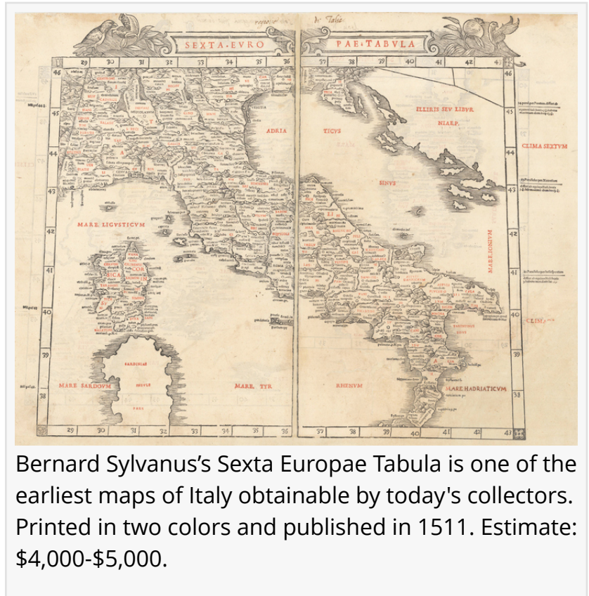
Bernard Sylvanus's Sexta Europae Tabula is one of the earliest maps of Italy obtainable by today's collectors. Printed in two colors and published in 1511. Estimate: $4,000-$5,000.

Ludwig von Bucholtz was hired to update of Herman Boye's 1827 four-sheet map of the state of Virginia and incorporate the growth in the western part of the state. The map was prized for its accuracy and detail, and was used by military leaders of both sides during the Civil War. Only 650 copies of A Map of the State of Virginia were printed, and surviving copies of the map are exceedingly rare. Bucholtz's map is lot 305 and is estimated to bring $14,000-$17,000.