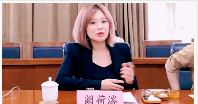
Jiangsu Enterprise Technology Matchmaking Event

KAOHSIUNG, TAIWAN, August 27, 2023 /EINPresswire.com/ -- On the morning of June 13th 2023, the Saudi Maramer Group - Jiangsu Enterprise Technology Matchmaking Event, organized by the Jiangsu International Science and Technology Exchange and Cooperation Center and the Provincial Association for Science and Technology Rural Center, was held at the Jiangsu Science and Technology Workers Activity Center. Twelve units participated in the event, including Jiangsu Gudao