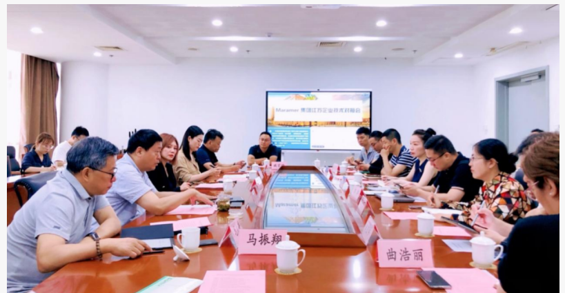
Jiangsu Enterprise Technology Matchmaking Event

During this visit to Jiangsu, they hope to create value from the recycling of plant and animal waste, and to assist plants and crops in maintaining health and increasing yield per unit area in Saudi Arabia's environment, soil, and climate conditions. They also aim to find and invest in relevant agricultural and environmental protection patent technologies, including high-wall landscape art in public places, urban farms, landscape design for city gardens, as well as seeking suitable building materials and new materials for landscape art.