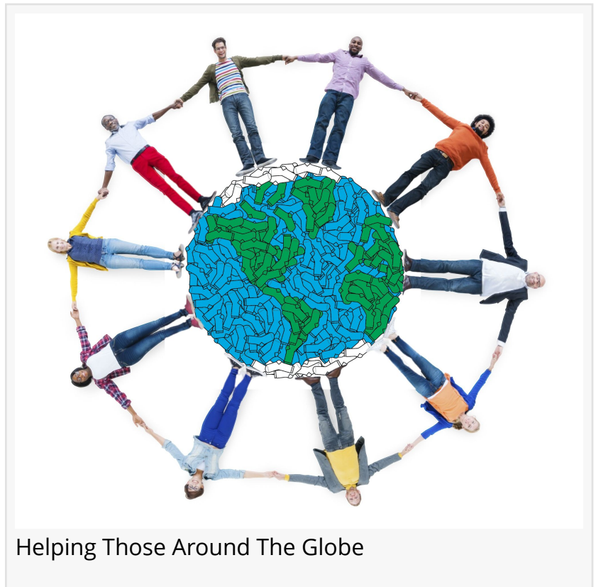
Helping Those Around The Globe