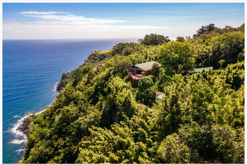
48-5432B Kukuihaele Road | Big Island, Hawaii

Angeles skyline paint a panorama beyond compare, and these idyllic views are unobstructed