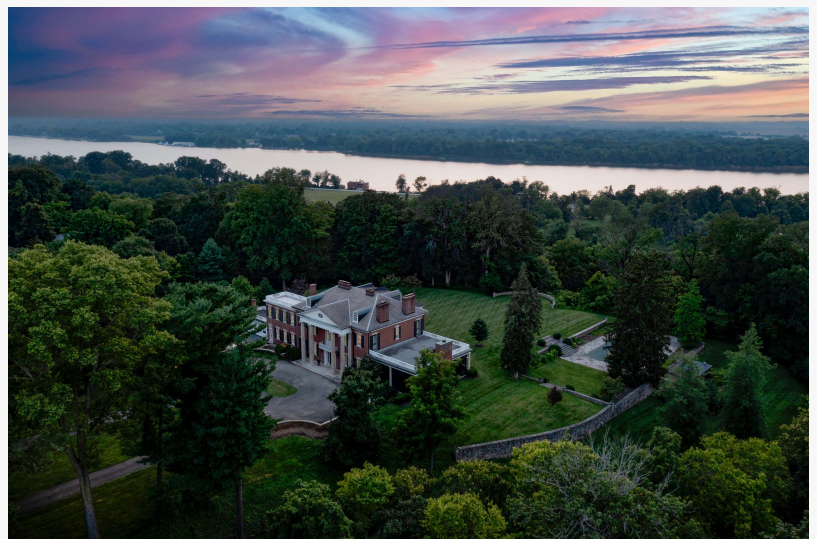
3200 Boxhill Lane | Louisville, KY