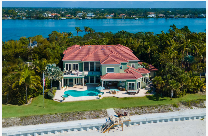
2305 Casey Key Road | Sarasota Area, FL