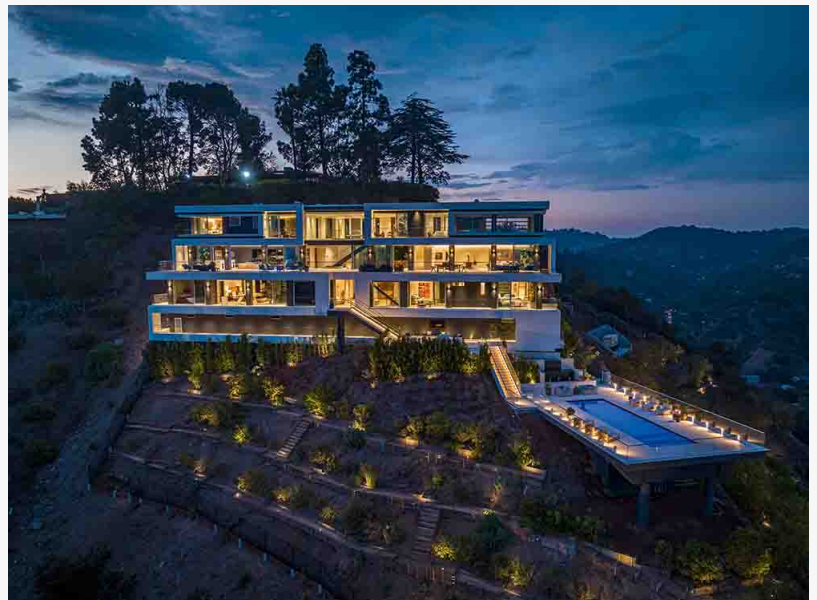
Bel Air Promontory | Bel Air, Los Angeles, California

Properties are available for viewing on conciergeauctions.com .