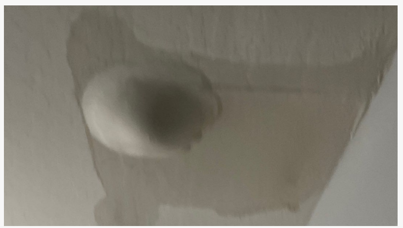
Bubbling in drywall is a visible sign of water damage.

families. Our goal is not just to restore properties, but to restore peace of mind. Our comprehensive approach allows us to address every facet of water damage, from the initial assessment to the final restoration, in a seamless and efficient manner," said Robert Atlas, owner of Phoenix Water Damage Services.