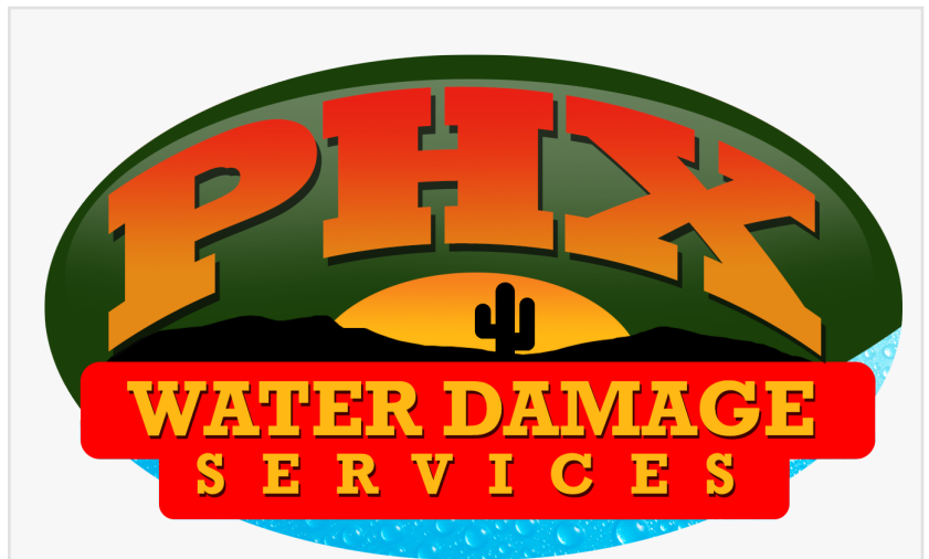
Phoenix Water Damage Services

"We understand the emotional and financial toll water damage can take on individuals and