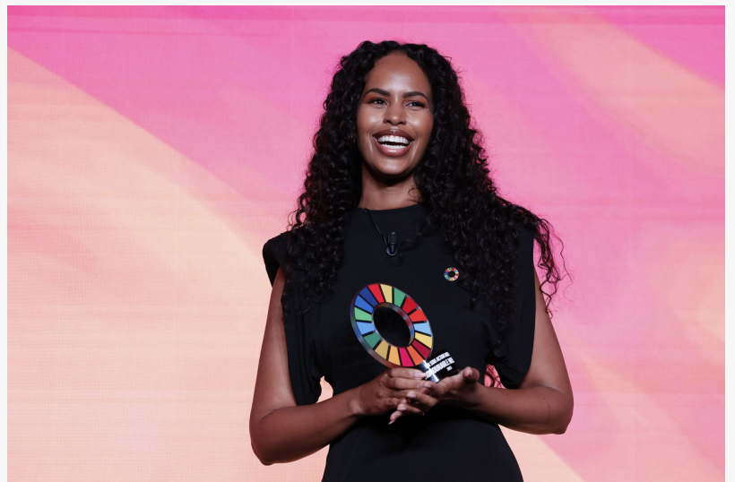
Sabrina Dhowre Elba and Idris Elba received Honourable Mention for their work as IFAD Goodwill Ambassadors