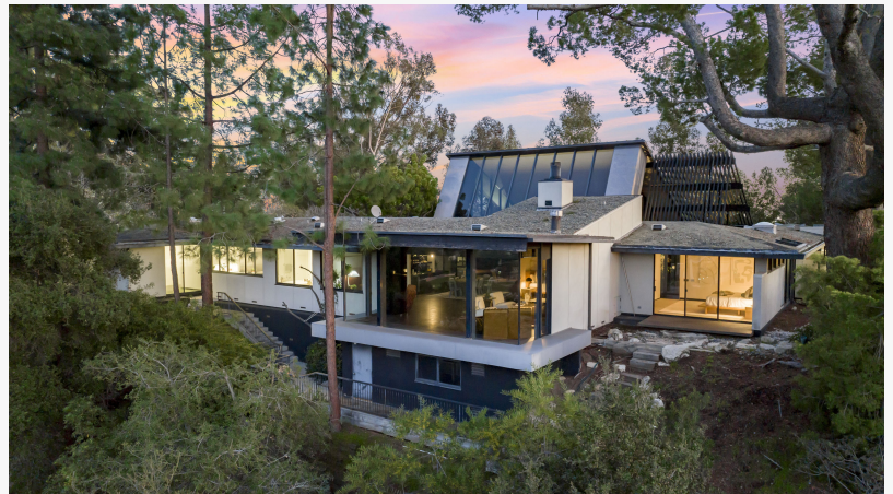
1100 Paso Alto Road | Pasadena, California