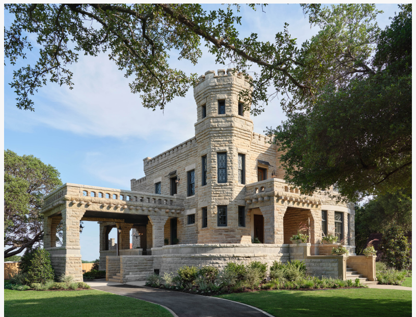
Historic Waco Castle | Waco, Texas