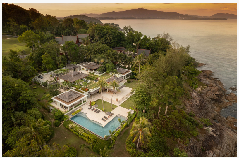
Trisara Resort, Villa 2 | Phuket, Thailand

Kaizen, located at 11870 Ellice Street, was constructed entirely from super engineered concrete to last several centuries with a unique and ageless design and architectural style. Completed in 2022, this unique work of art embodies the singular vision by property owner Kris Halliday of MKH Developments from concept, architecture, and design to construction and bespoke furnishings, designed to provide a modern luxury sanctuary with a beach vibe. The home was influenced by ancient civilizations, incorporating Feng Shui and nature throughout. Take in