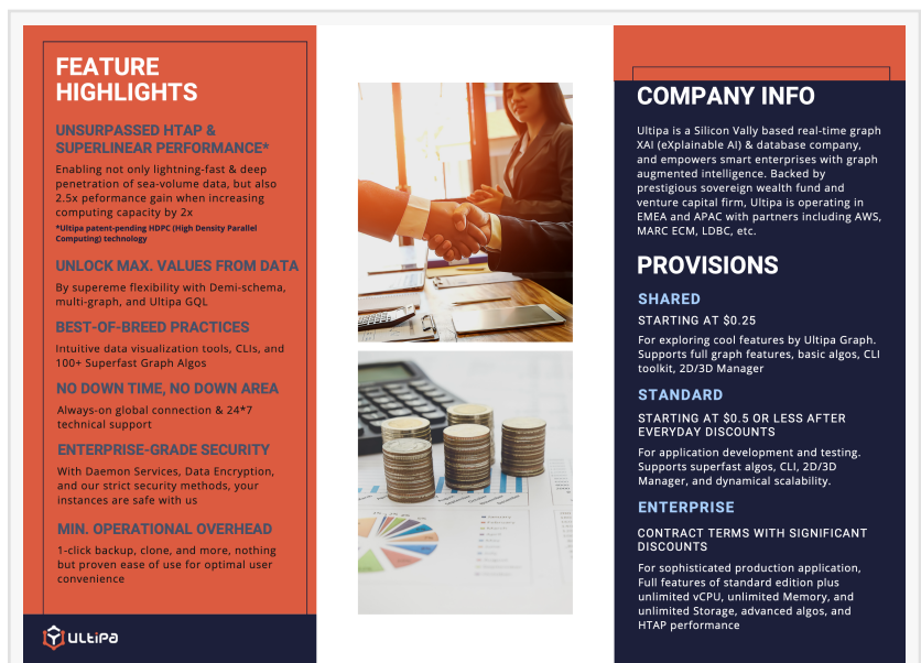
Ultipa Cloud Brochure 2