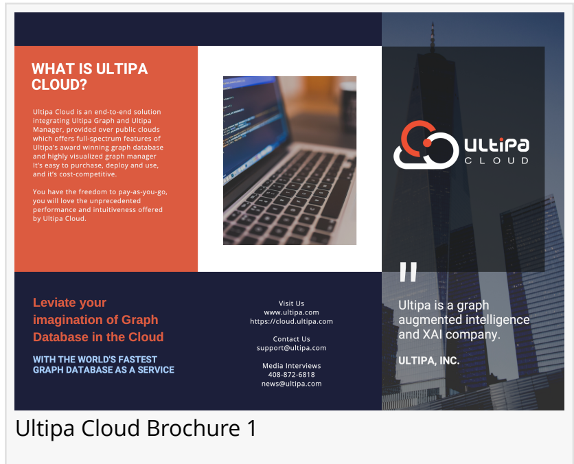
Ultipa Cloud Brochure 1

We are excited to announce that Ultipa Cloud introduces the Shared Edition, on top of the existing Standard Edition! This new edition brings even lower cost, more convenience and scalability to our valued users.