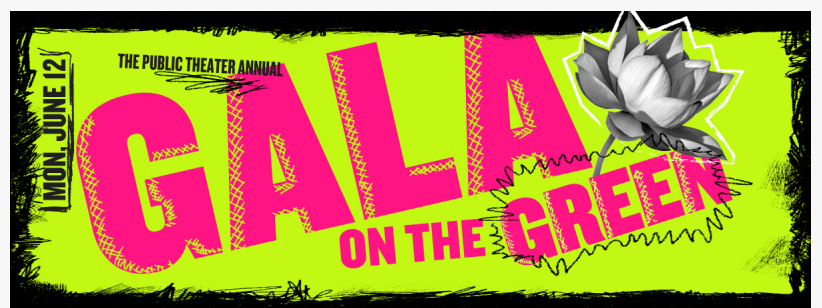
Public Theater Gala