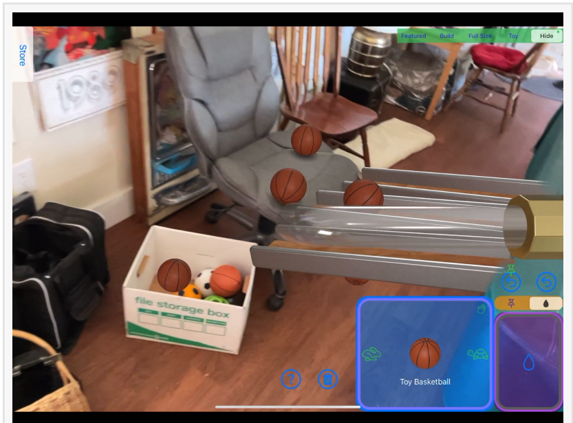
Seamless Virtual Balls Cross Real Furniture

The app offers a growing Reality Store with in-app purchases. Today's release lets users play with every item in the Store in combination, using new free and paid Unlock All Items features.