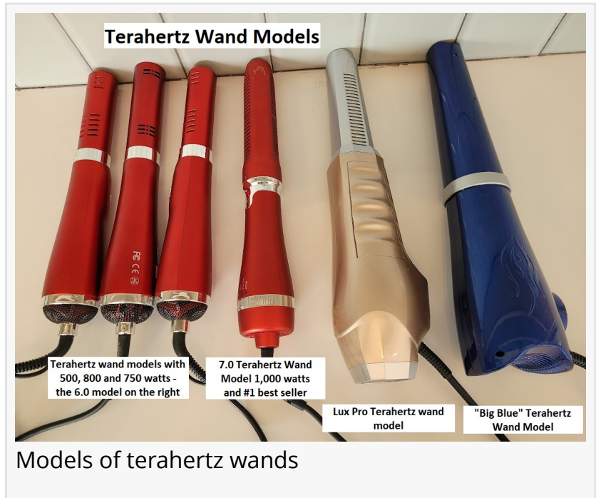
Models of terahertz wands