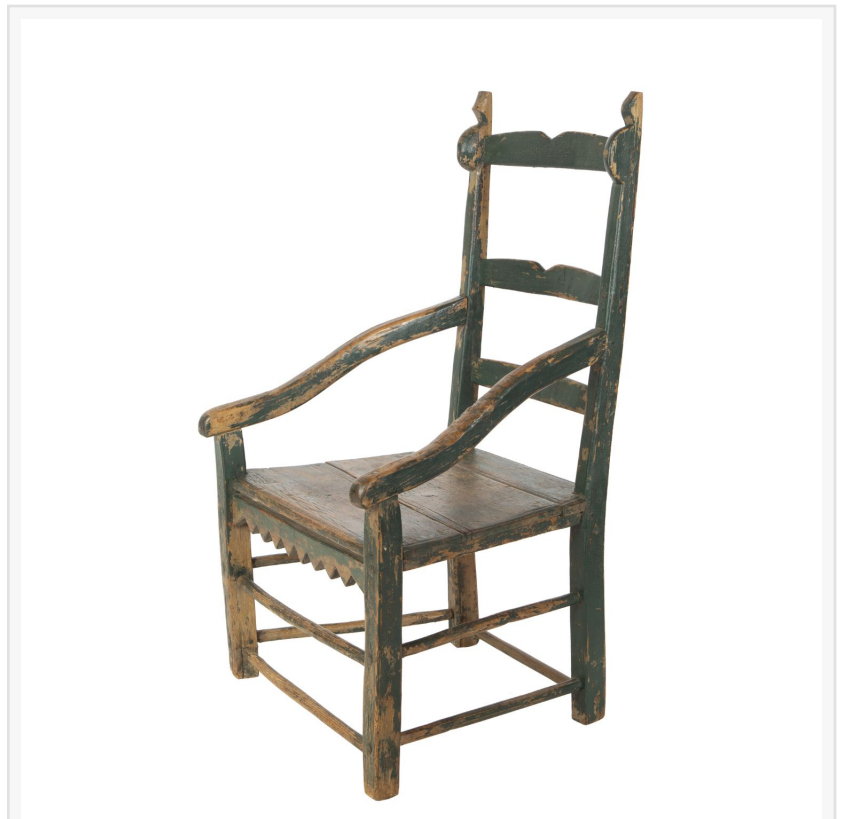
Louis XIII armchair from the Bastien family on the Huron-Wendat reserve in Loretteville, Que., in old green paint with slanted back posts and hand-cut sawtooth skirt (CA$21,240).

Following are additional highlights from the auction, which featured 359 lots of 18th and 19th century Quebec furniture, folk art, sculpture and Canadiana in a sale that grossed $351,079. More than 100 people attended the event live at the hotel, while 398 others registered to bid online (via LiveAuctioneers.com and MillerandMillerAuctions.com) and placed 7,900 bids. 99 percent of all lots were sold and 50 percent of the top 50 lots exceeded estimate.