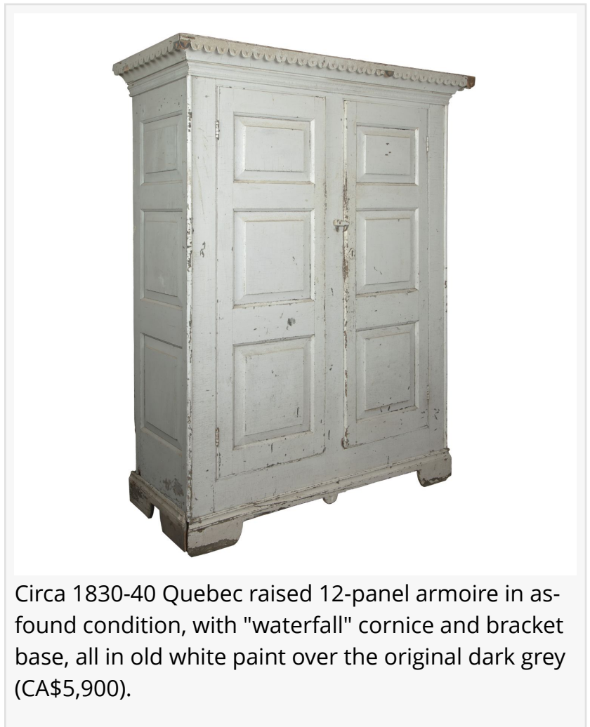
Circa 1830-40 Quebec raised 12-panel armoire in as-found condition, with "waterfall" cornice and bracket base, all in old white paint over the original dark grey (CA$5,900).