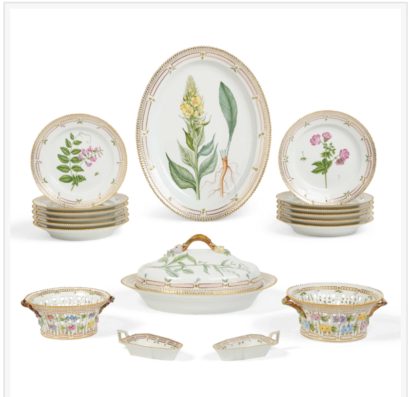
Extensive collection of Royal Copenhagen Flora Danica porcelain tableware (est. $400-$7,000).