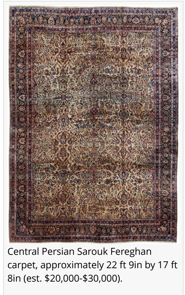
Central Persian Sarouk Fereghan carpet, approximately 22 ft 9in by 17 ft 8in (est. $20,000-$30,000).

Aileen Ward Andrew Jones Auctions + +1 213-748-8008 email us here