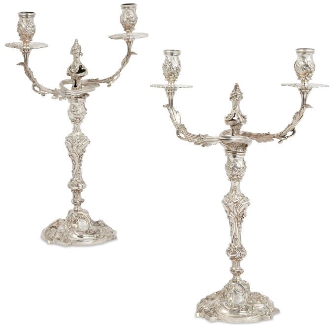
Pair of George III sterling silver two light candelabra (William Tuite, London, 1764) (est. $10,000-$20,000).