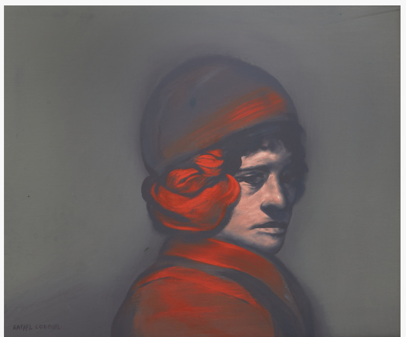
Oil on canvas painting by Rafael Coronel, titled Man in Red (est. $8,000-$12,000).

The Moldaws' collection also includes Asian and European furniture, such as a Chinese hardwood bench (est. $1,500-$2,000), as well as lacquer tables and an impressive gilt and black coromandel lacquer eight-panel floor screen (est. $8,000-$12,000). European furnishing highlights include a late Regency leather upholstered armchair (est. $800-$1,200), a pair of Louis XVI white painted fauteuils (est. $2,000-$3,000) and a Steinway & Sons piano.