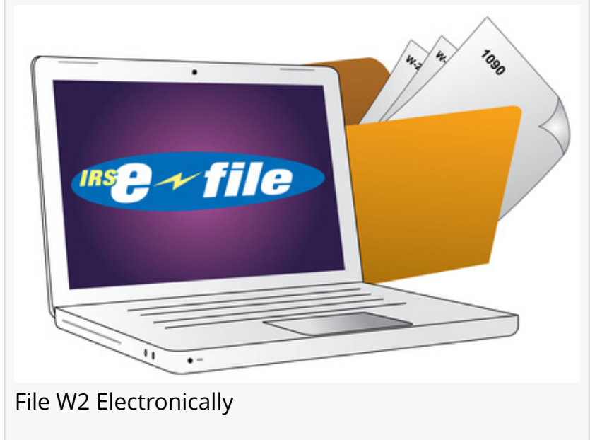
File W2 Electronically