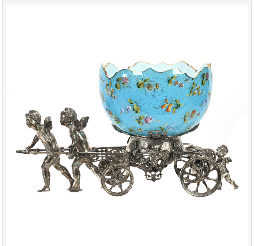
Victorian brides' basket, featuring a blue cased art glass bowl with silver mica highlights and a colorful enamel scattered floral décor, set on an incredible Rogers Bro. #186 silverplate frame ($9,000).