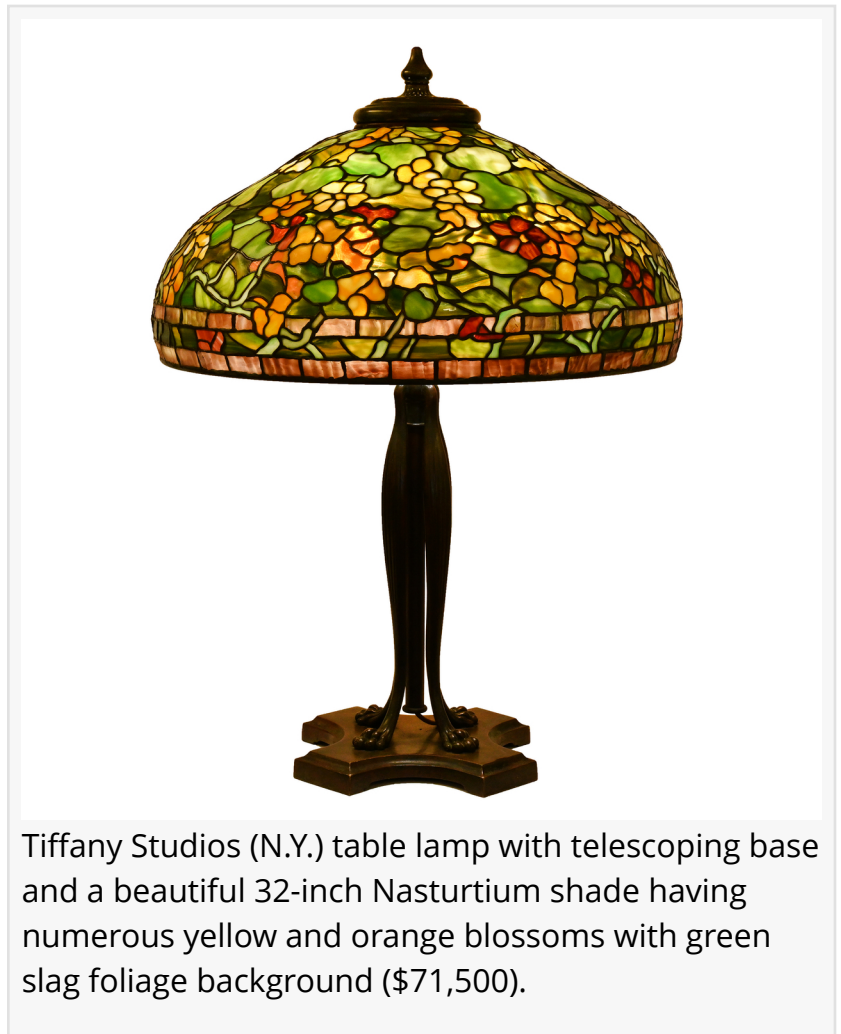
Tiffany Studios (N.Y.) table lamp with telescoping base and a beautiful 32-inch Nasturtium shade having numerous yellow and orange blossoms with green slag foliage background ($71,500).

A signed Galle blown mold French cameo art glass vase in the Plum pattern, 13 ¼ inches in