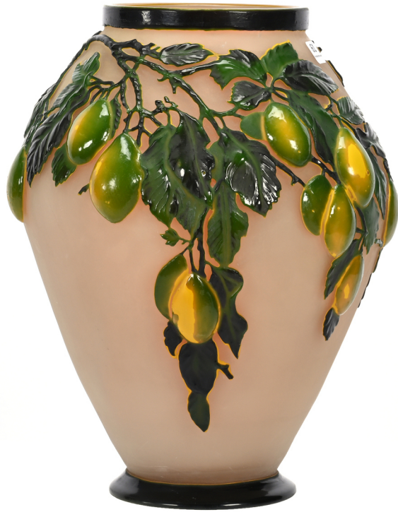
Signed Galle blown mold French cameo art glass vase in the Plum pattern, 13 ¼ inches tall, with incredible two-color green and yellow cameo carved overlay ($9,500).

This press release can be viewed online at: https://www.einpresswire.com/article/631596983 EIN Presswire's priority is source transparency. We do not allow opaque clients, and our editors try to be careful about weeding out false and misleading content. As a user, if you see something we have missed, please do bring it to our attention. Your help is welcome. EIN Presswire, Everyone's Internet News Presswire™, tries to define some of the boundaries that are reasonable in today's world. Please see our Editorial Guidelines for more information. © 1995-2023 Newsmatics Inc. All Right Reserved.