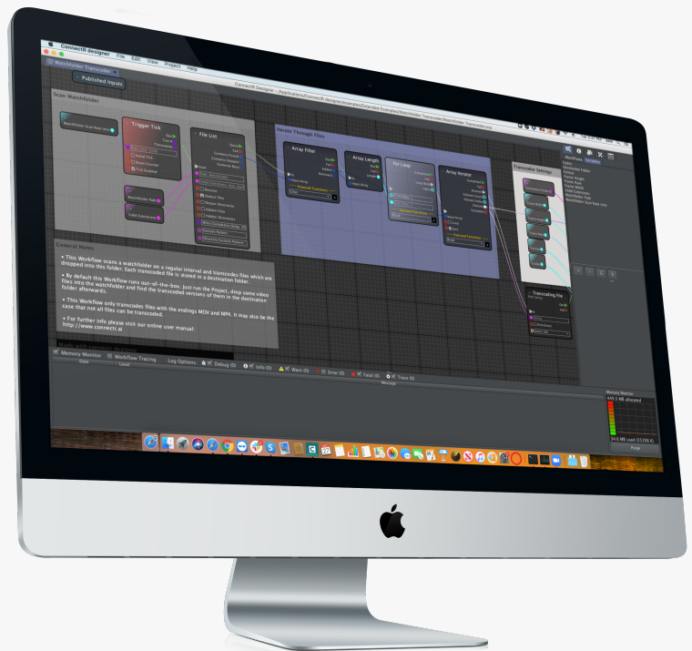
Connectr workflow automation