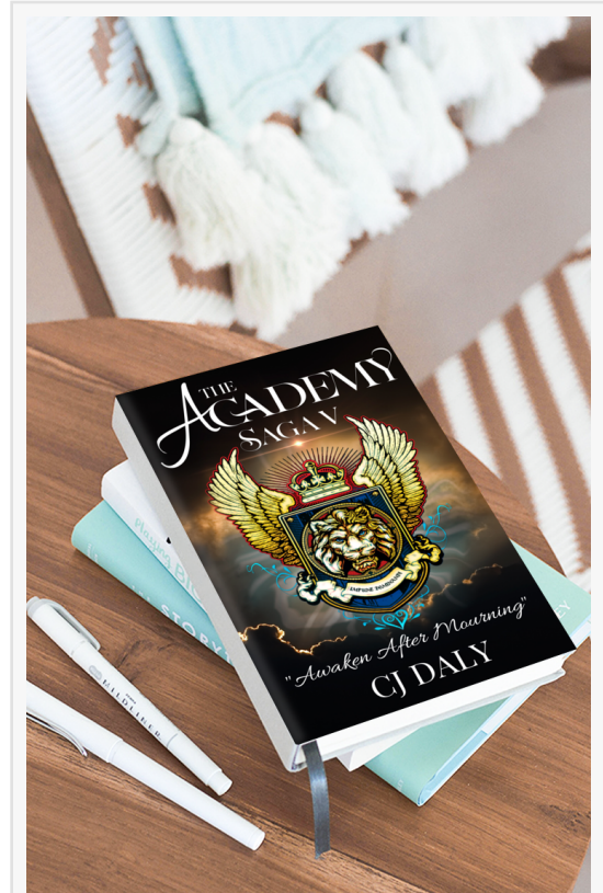
Book 5 in "The Academy Saga" series by Author CJ Daly has fans falling hard!

This press release can be viewed online at: https://www.einpresswire.com/article/624160230