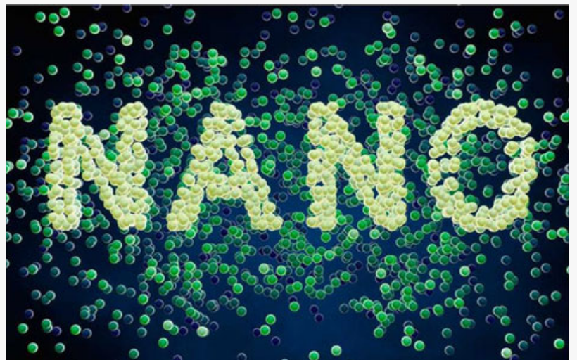
Nanobles Corporation in the Bay Area of California has entered into Collaboration with NANO HEMP Tech Labs