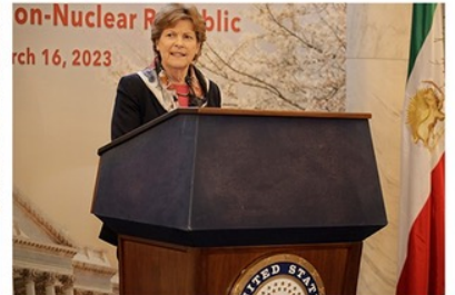
Senators Sheehan & Tillis