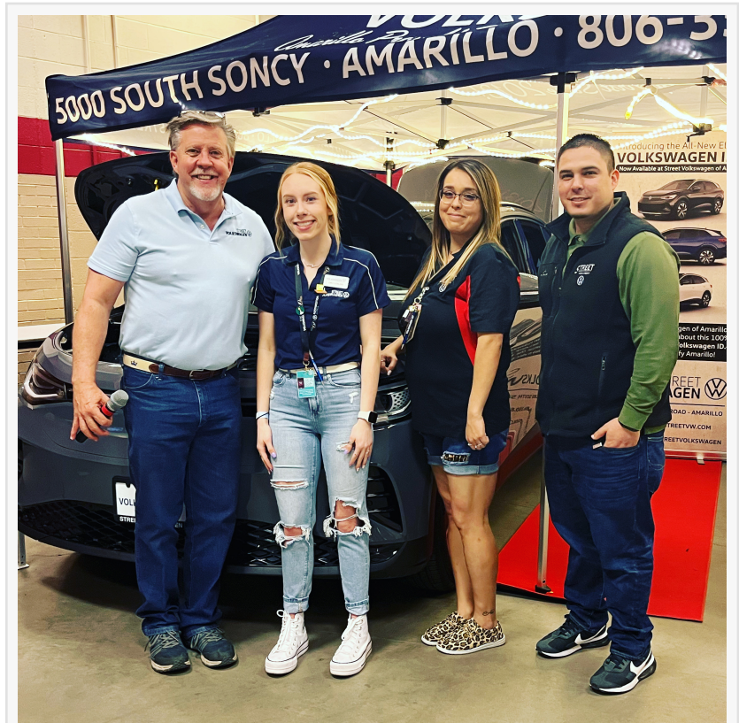
Street Volkswagen Employees attend community events to meet and interact with customers.

Street Volkswagen of Amarillo opened in Amarillo, Texas in 2013 and has since been a valuable corporate citizen in the Texas Panhandle. They provide support to area nonprofit organizations such as Family Support Services, Young Life, United Way, the High Plains Food Bank, AAF- Amarillo, the Chamber of Commerce, the Hispanic Chamber of Commerce, West Texas A&M