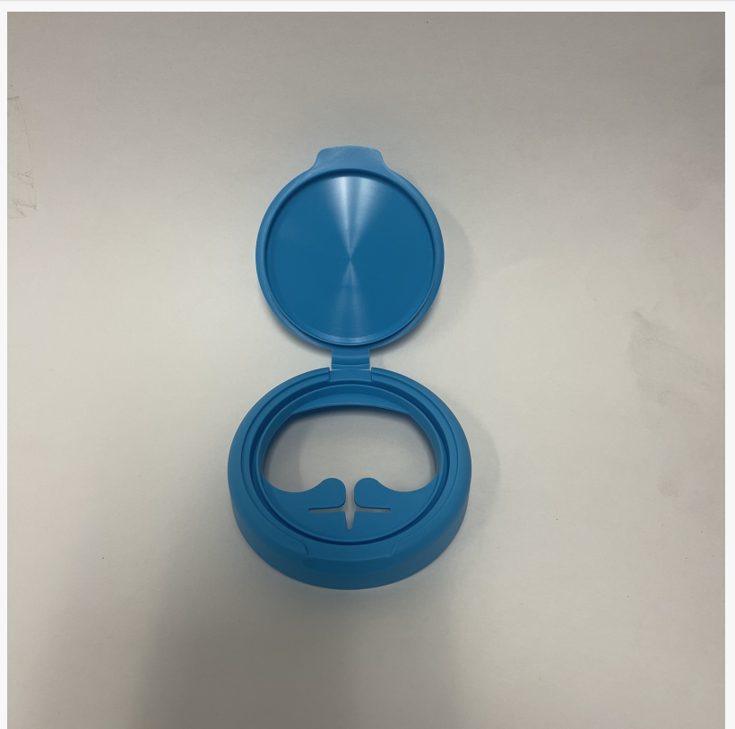
plastic lid manufacturing company

businesses large and small. With International Standards on air, water and soil quality, emissions of gases and radiation, and environmental aspects of products, they protect the health of the