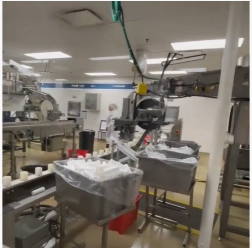
HTI Plastics - Assembly Area

Below is a list of manufacturing certifications HTI Plastics holds.