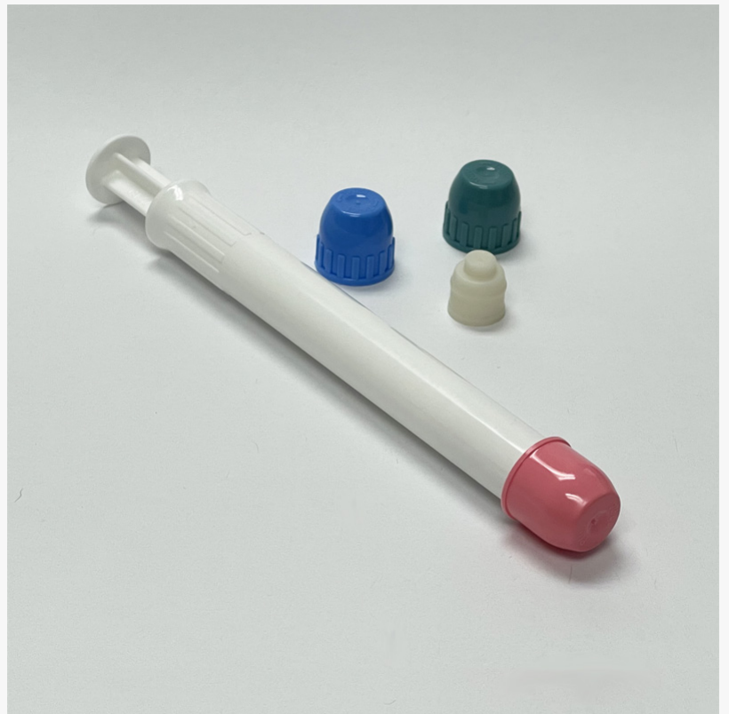
Pre-fill applicator products