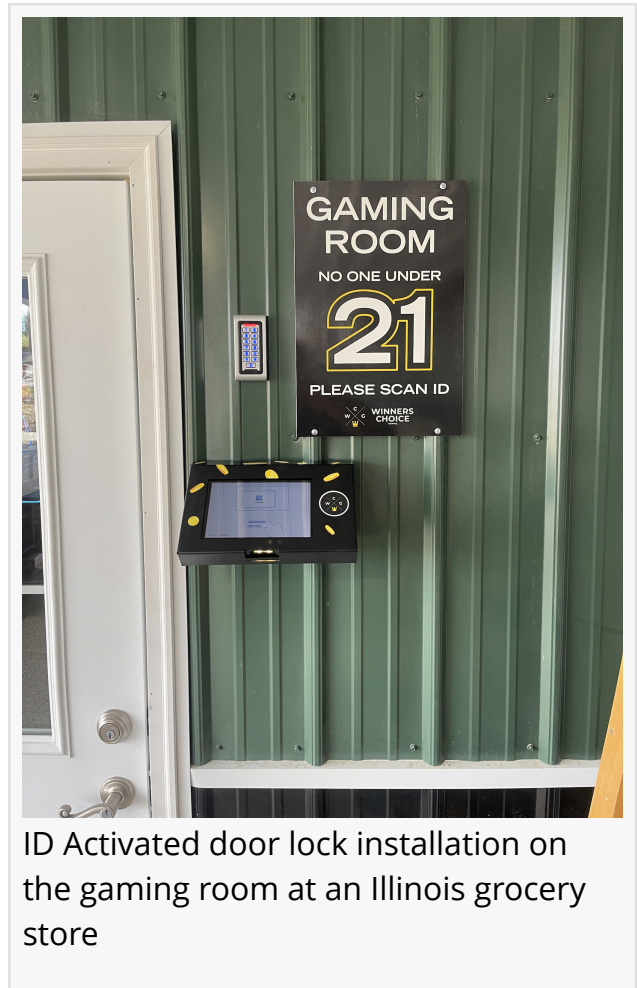
ID Activated door lock installation on the gaming room at an Illinois grocery store

ID-activated access control has broad applications outside of just gaming. Using Allow Lists, this