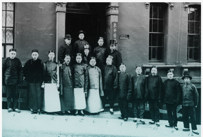
Tung Wah Dispensary opened in 1900 by the Chinese Six Companies at 828 Sacramento Street in San Francisco.

This press release can be viewed online at: https://www.einpresswire.com/article/613446925