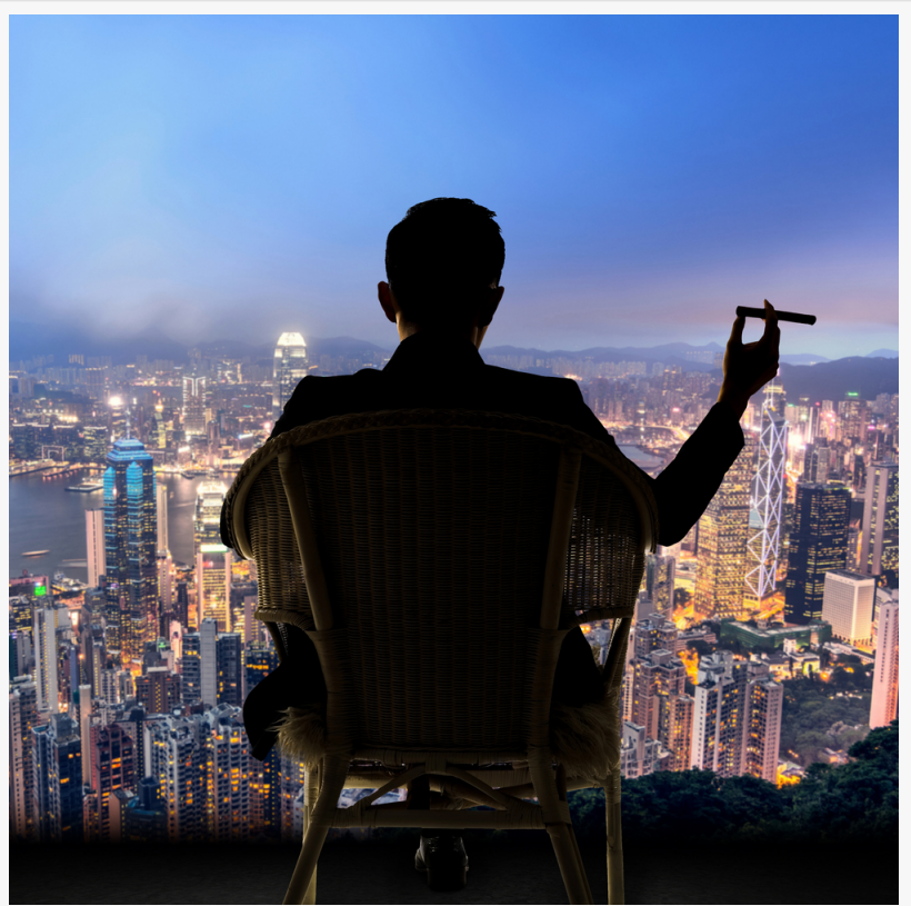
A man of power gazes over Hong Kong, an international economic powerhouse.

Due out in March, a pre-publication discount is offered only on the publisher's website. Offer Expires 3/4/23.