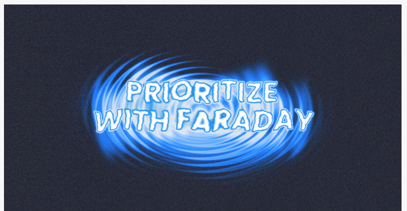
Prioritize with Faraday

How to easily select exploitable vulnerabilities that could most expose or hurt organization's infrastructure? It is the question of how to prioritize efficiently. We know that customers need context information to reduce hundreds of critical vulns into a few and have more time to center their attention on what really matters.