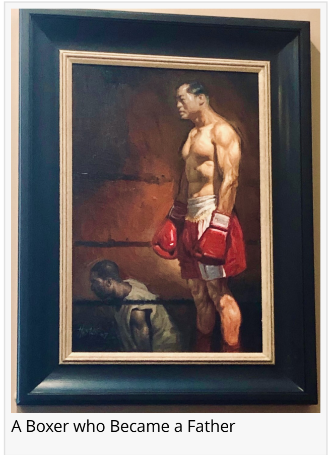
A Boxer who Became a Father