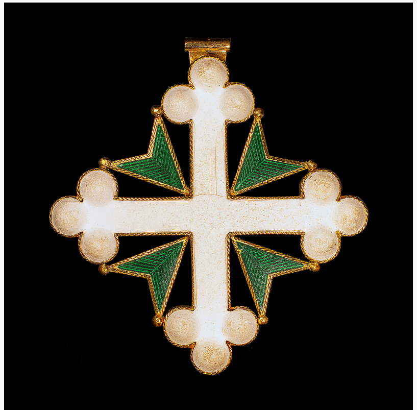
This rare medal presented by the Order of Saint Maurice and Saint Lazarus, the world's second oldest order of knighthood, is one of the highlights in the December 3, 2022 Holabird Western Americana Collections auction of recovered S.S. Central America sun