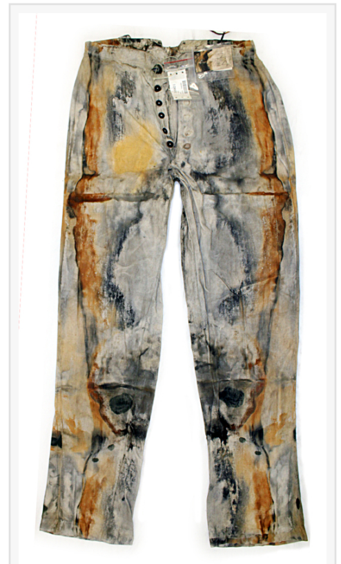
These miner’s work pants with a button fly, recovered from the 1857 sinking of the S.S. Central America, are the oldest known California Gold Rush-era jeans of their kind and may have been made by or for Levi Strauss.

For additional information about the recovered artifacts auctions planned for December 2022 and February 2023 and to obtain a printed catalog, visit Holabird Western Americana Collections of Reno, Nevada at www.HolabirdAmericana.com , call 775-851-1859, or email info@holabirdamericana.com .