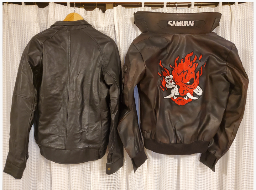
Cyberpunk 2077 Style Leather Jacket Made Popular by Keanu Reeves' Voice