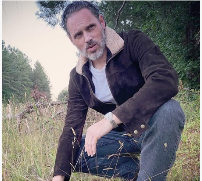
Rick Grimes The Walking Dead Style Leather Jacket

The new focus on cosplay leather jackets that are originally inspired by comics, a favorite