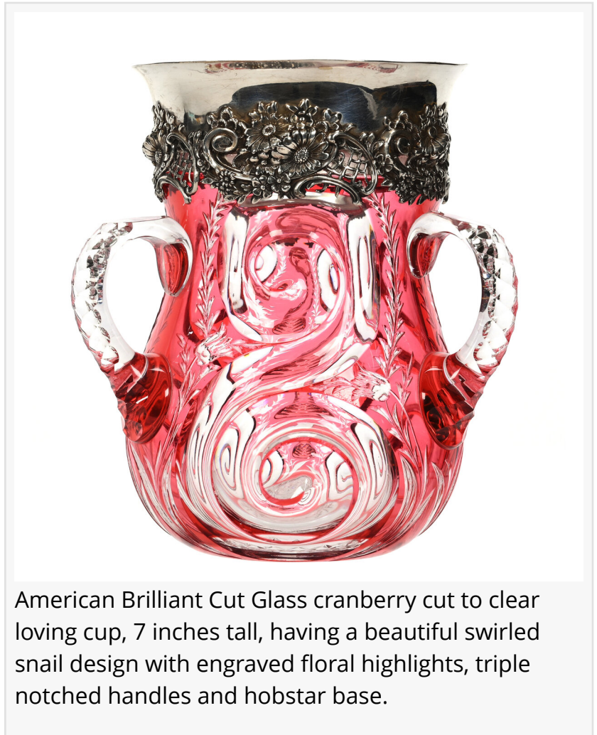
American Brilliant Cut Glass cranberry cut to clear loving cup, 7 inches tall, having a beautiful swirled snail design with engraved floral highlights, triple notched handles and hobstar base.

Jason Woody Woody Auction +1 316-747-2694 email us here