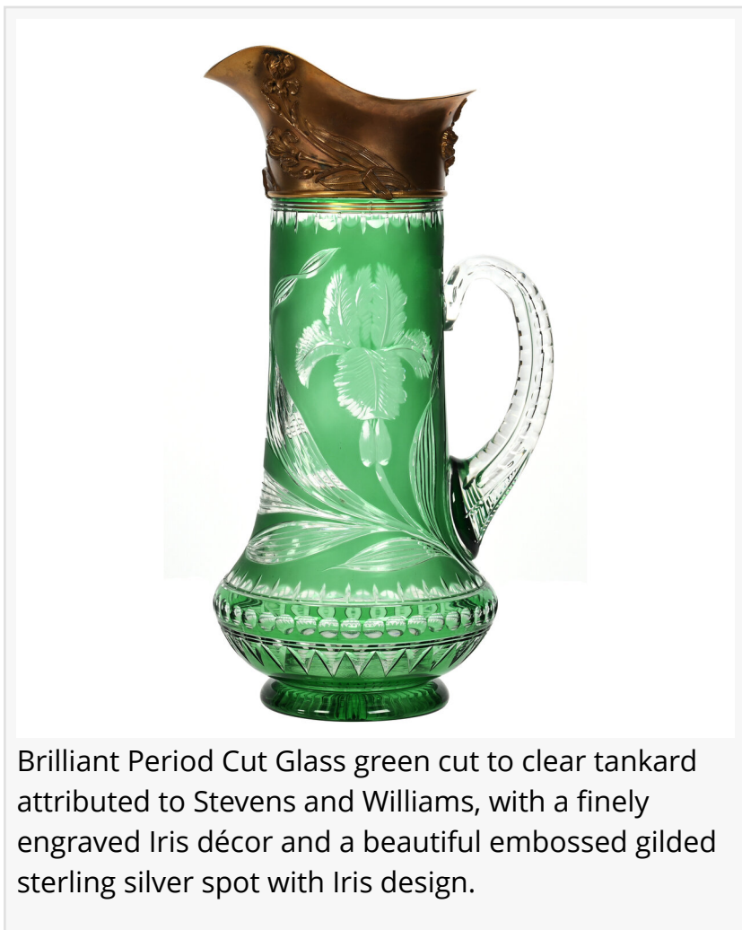
Brilliant Period Cut Glass green cut to clear tankard attributed to Stevens and Williams, with a finely engraved Iris décor and a beautiful embossed gilded sterling silver spot with Iris design.