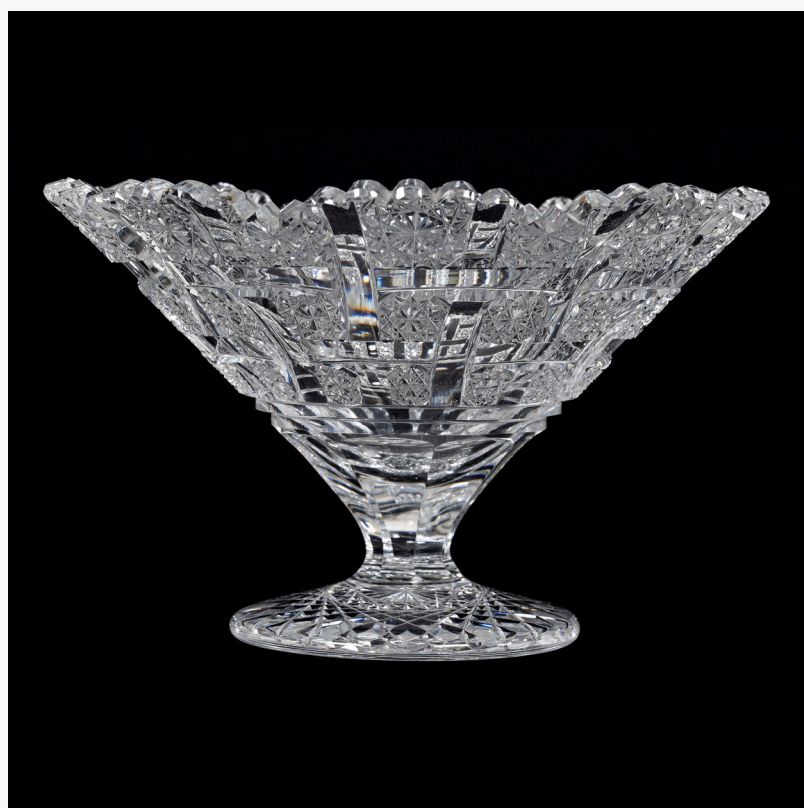
American Brilliant Cut Glass tazza (shallow bowl of wide form, standing on a footed stem), in the Willow pattern by Hawkes, 5 \frac{3}{4} inches by 9 inches, with a hobstar foot and fabulous blank.

This press release can be viewed online at: https://www.einpresswire.com/article/598790261