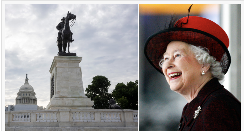
U.S. Capitol, Statue of Ulysses S. Grant, and Queen Elizabeth II

House Committee on Energy and Commerce passed the Prevent All Soring Tactics (PAST) Act, H.R. 5441, by a vote of 46 to 9 in a markup that will now advance the measure to the House floor for a vote.