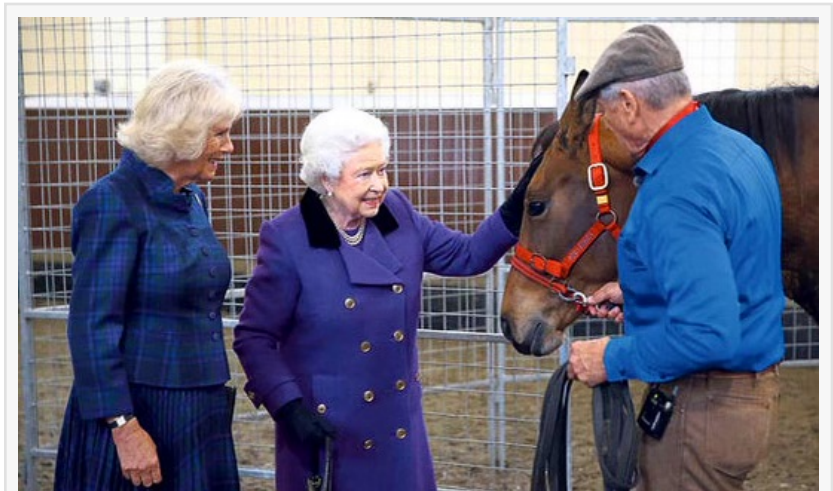
Queen Elizabeth II is shown a horse by renowned trainer Monty Roberts. The late regent was a patron of Mr. Roberts' Join-Up International, which provided the photo.

"As you know, the late queen was a great horse advocate and apparently weighed in at some