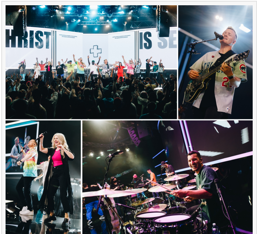
Planetshakers members are pictured during the recording of GREATER at the GREATER Conference held this year in Melbourne, Australia.