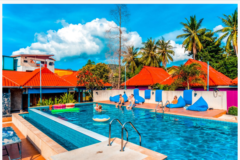
Bodega Koh Phangan Roadside