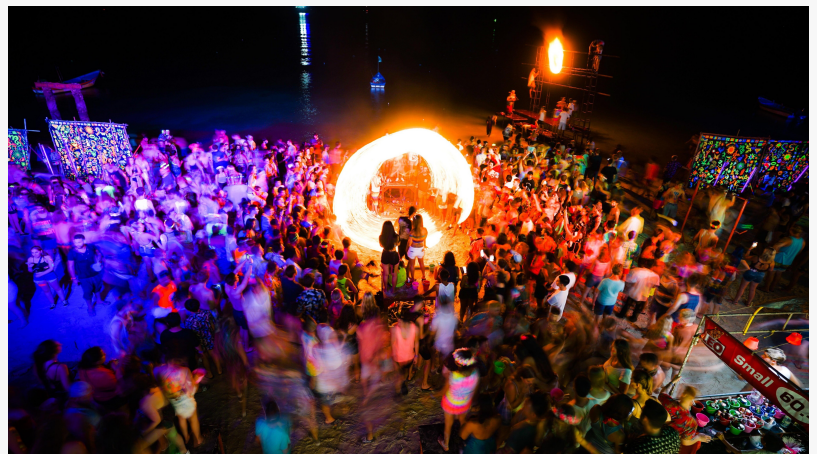
Full Moon Party - Koh Phangan

This press release can be viewed online at: https://www.einpresswire.com/article/587677496