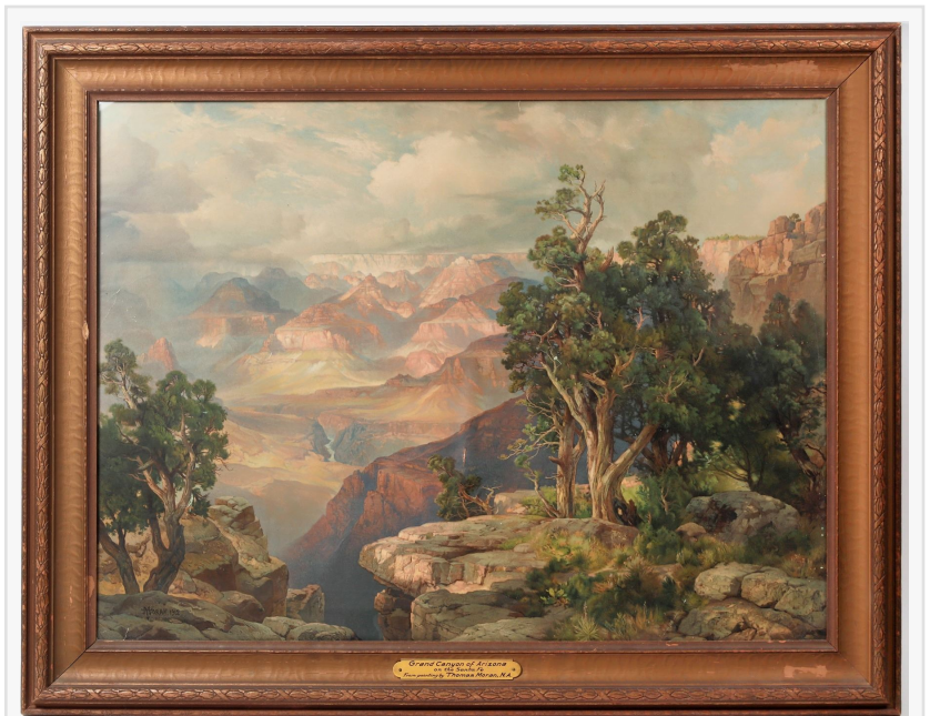
Chromolithograph of the Grand Canyon by Thomas Moran (1837-1926), dated 1912, housed in the original frame measuring 41 ½ inches by 33 inches, signed by Moran (est. $4,000-$6,000).

Day 2, on Friday, August 26th, will feature philatelic (to include covers, featuring the Bracken Colorado collection, stamps, RN checks and ephemera); stocks and bonds (including Express and early American, railroad and mining, featuring the