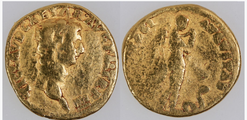
Very rare aureus (ancient Roman gold coin), depicting Claudius (AD 41-54), conqueror of Britain, and Pax as a winged nemesis driving the snake of good fortune (est. $3,000-$3,500).