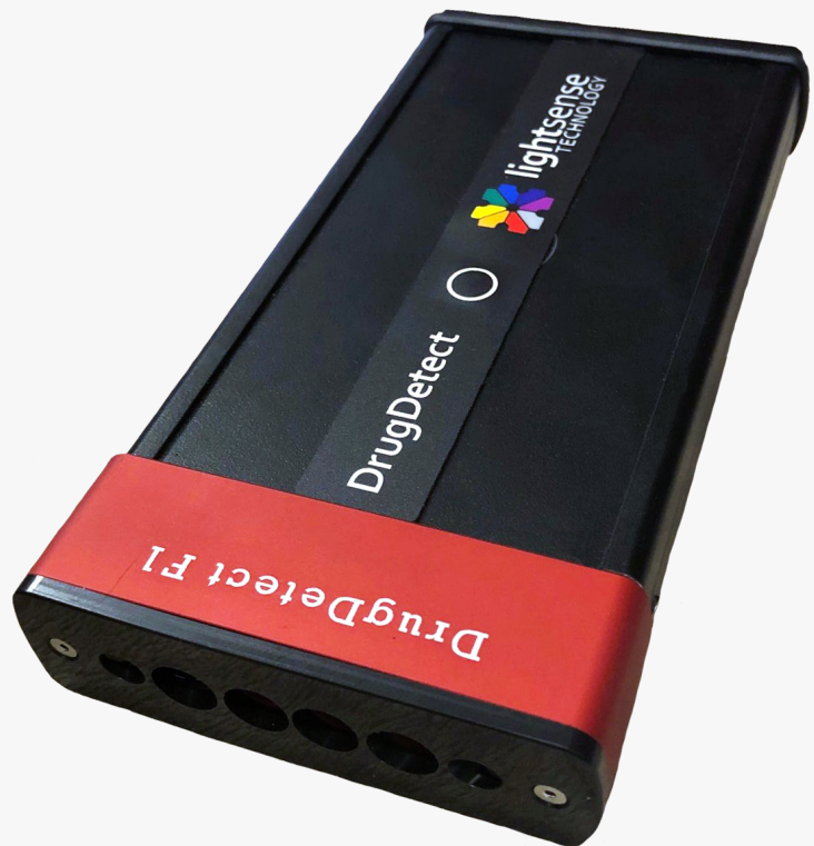
Lightsense DrugDetect-F1: Fentanyl and Methamphetamine Spectral Scanner