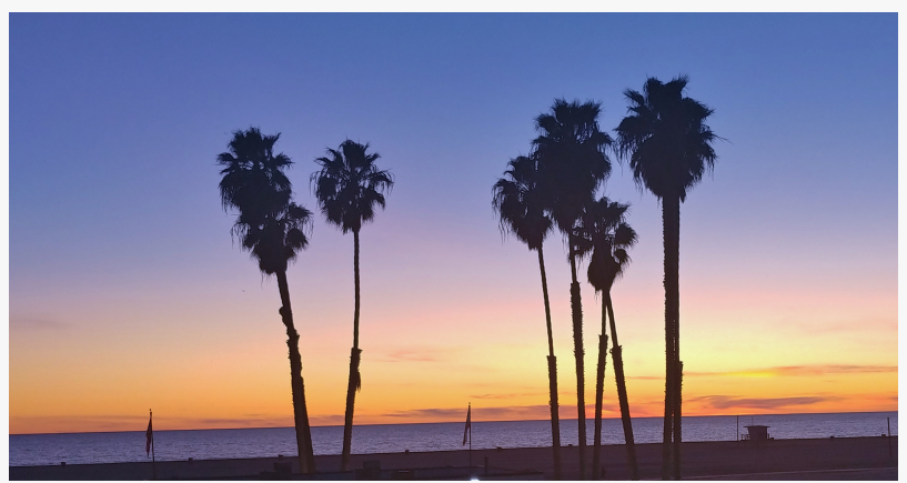
Right at the Beach