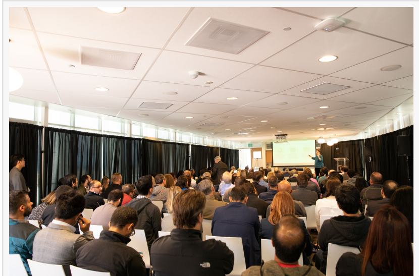
Always Great Talks at the ISSA-LA Summits

SANTA MONICA, CA, UNITED STATES, July 18, 2022 /EINPresswire.com/ -- The Los Angeles Chapter of the Information Systems Security Association (ISSA-LA) presents world-renowned experts in security and privacy at this year's ISSA-LA Security Summit XII at the Annenberg Beach House in Santa Monica, California on September 20 – 22, 2022.