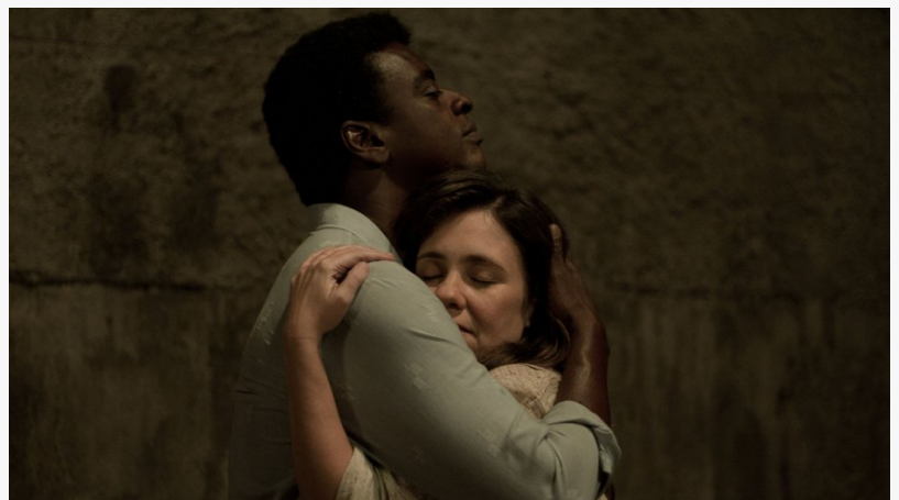
Wagner Moura's Marighella - which had its world premiere out of competition in Berlinale 2019.