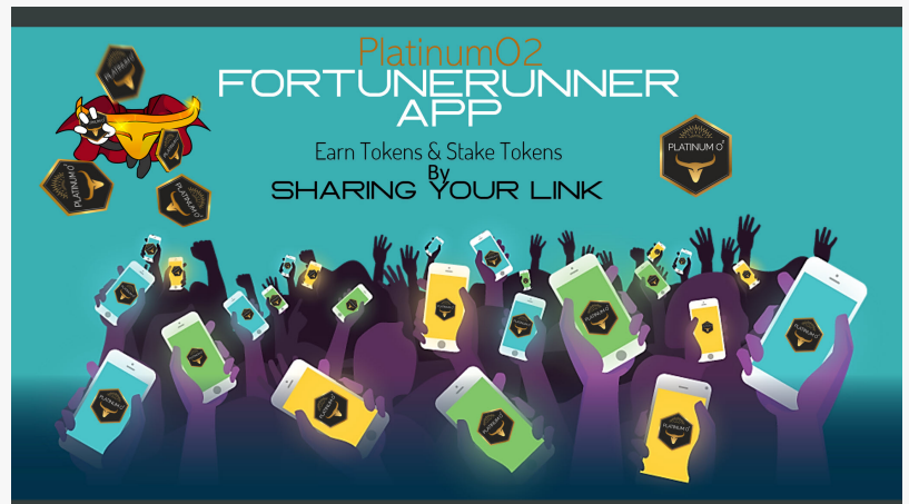
PlatinumO2 Innovations for the Crypto Markets