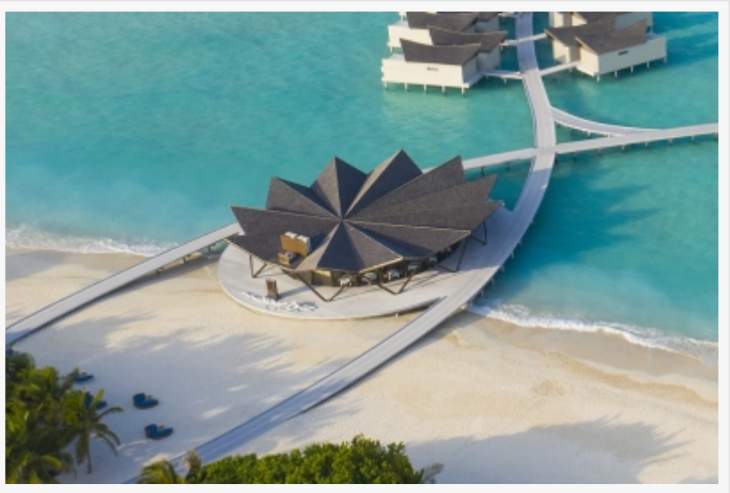
Bodumas Overwater Seafood Restaurant Company: MOTIV Studio Lead Designer: Pawel Podwojewski Project Location: Noonu atoll, Republic of Maldives

"From the outset of the project, the Fairmont Olympic Hotel's restoration sought to provide a space where guests and locals could enjoy the hotel's rich heritage from a new perspective with the introduction of a lively bar in the lobby's lounge area. The new Olympic Bar adds color, lighting and luxurious layering all while respecting the history and heritage of the surrounding interior. These traditional elements are contrasted further by the introduction of a kinetic art installation that draws inspiration from the hotel's historic ship logo. Altogether, this transformation is the beginning of a new chapter in the timeless tale of the hotel that will,