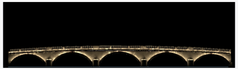
CGI render of what the bridge will look like using latest LED technology

Leander, Phyllis Court and Blandy & Blandy support the 10 year arts project