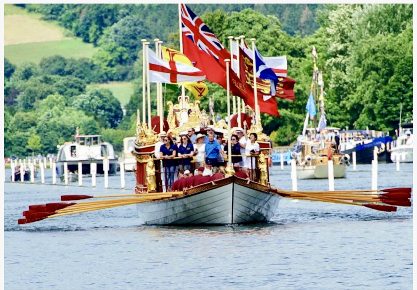
Henley on Thames a great town to visit with festivals and regattas all the year round