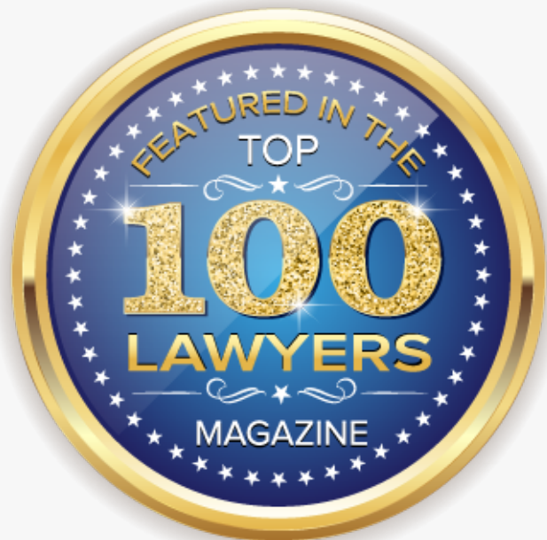
Nationally Recognized Shareholder Rights Attorney Timothy L. Miles to Be Featured in the Upcoming Edition of the Top 100 Lawyers Magazine